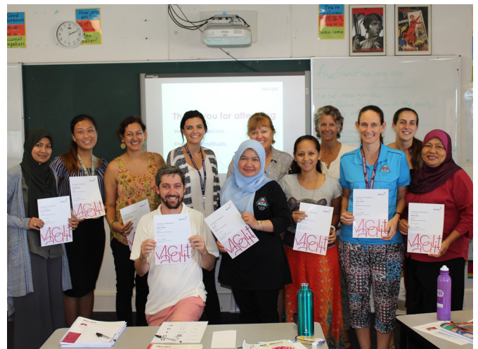
Christmas Island District High School is trilingual; staff at the conclusion of their MacqLit training

Reflecting the cultural diversity of the island's population, most of the students speak a language other than English at home